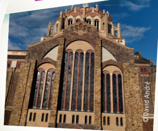
20 The Sacré-Cœur church