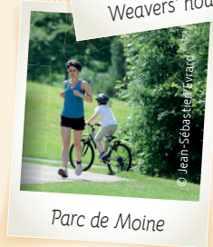
Parc de Moine

This alternative route comes highly recommended! Take the orange route