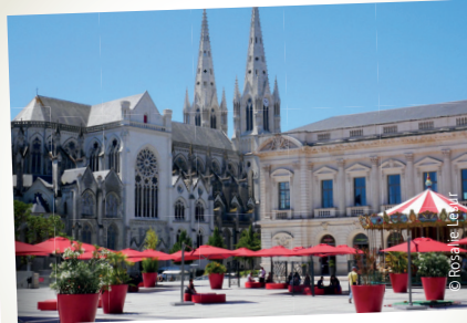
16 Travot square

Join us and explore on a walk starting from the Tourist Office