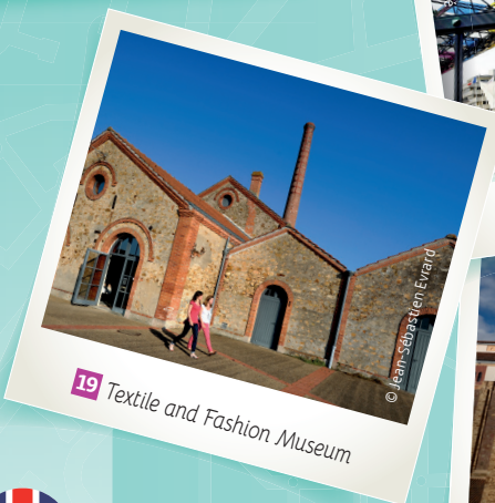
19 Textile and Fashion Museum