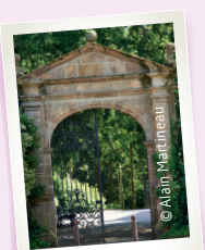
Jardin du Mail

The locals call this building the "typewriter". Despite the nickname, it remains a very fine example of avant-garde 1970s architecture.