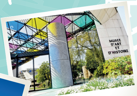
1 Museum of Art and History